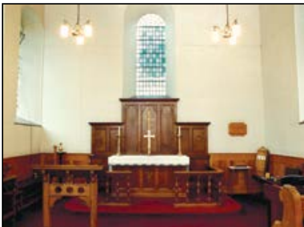
The altar in 1994

In 1988 the newly appointed Trustees had commissioned a value for money audit and adopted an ambitious reinvestment policy which involved moving the endowment funds out of agricultural and stock-market holdings and shifting the investments into commercial properties with much better financial returns.