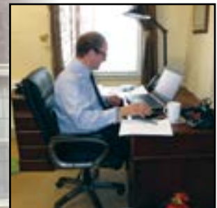
Business Manager's Office