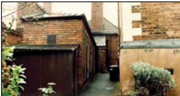
The original almshouses' privies in use as sheds but replaced by the kitchen and toilets in 1997

1997 - The first call on the newly found surpluses was the repair of the roofs of the two main houses at Berkeley's but after that, a decision was taken to plough some of the proceeds into a chapel refurbishment sinking fund. By the end of 1997 the necessary funds had been accumulated.