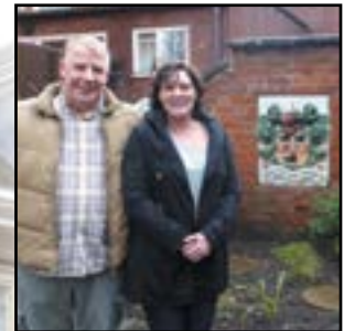
Nash's and Wyatt's Court