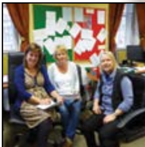
The Main Office