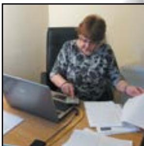
The Accounts Office