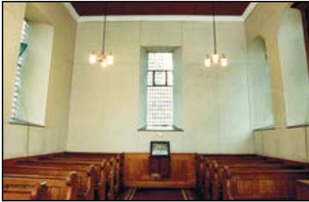
The rear of the chapel in 1994 before the door to the kitchen area was created. Note the false ceiling which was removed and the window which was reduced in size to make space for the new door