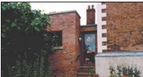
The new kitchen and toilets built in 1997