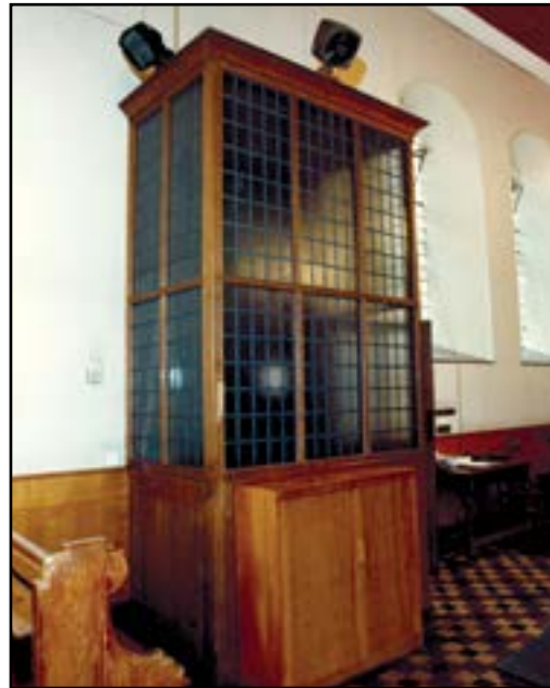
The porch to the door in 1994 with electric fan heaters on top

However the planning and listed building application proved hotly contentious with local preservation societies alarmed by the alleged "vandalism" to a 17th Century building of national importance. An alternative proposal was put forward to site the planned kitchen and toilets in the middle of the rear lawn rather than next door on the site of the old privies.