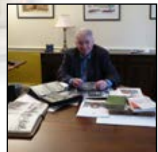
The Chairman's Room

The Charities' Offices are opposite the Hopmarket Telephone 01905 317117 for an appointment